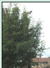
Spot the camera!

2008. A larger number require a crown lift [pruning lower branches to remove obstructions] in the short-term. The works will include the removal of a few dead trees. All other works will be looked at in the autumn.