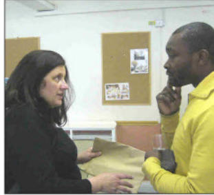
Dalgarno Peabody Estate Tenants Association AGM 2008